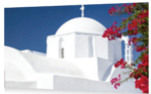
VPL-HW45ES & VPL-HW65ES

Conventional Home Cinema projectors sacrifice some colour accuracy by increasing greens to improve brightness. With Bright Cinema and Bright TV modes, the VPL-HW45ES & VPL-HW65ES retain true colour and contrast, even in a bright environment.