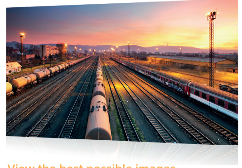
View the best possible images

Developed for our leading 4K Home Cinema projector range, our next generation Reality Creation reproduces colours and textures that are lost when movies are packaged to disc. It gives you crisper, sharper Full HD pictures, much closer to the 1080p original, for even better upscaling.